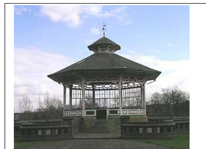
Bandstand, Greenhead Park

Though not strictly a planning issue, the successful application for a grant from the Heritage Lottery Fund to restore Greenhead Park must be a matter for rejoicing. For too long our parks nationally have been neglected and kept going with the minimum of care. We may be seeing a national change of heart. Certainly the award of £4 million to restore Greenhead will make a major impact : a restored lake, a Japanese-style bandstand and restored gardens are among many planned improvements. We are not yet clear whether the bandstand will be a replacement for the existing one, which was