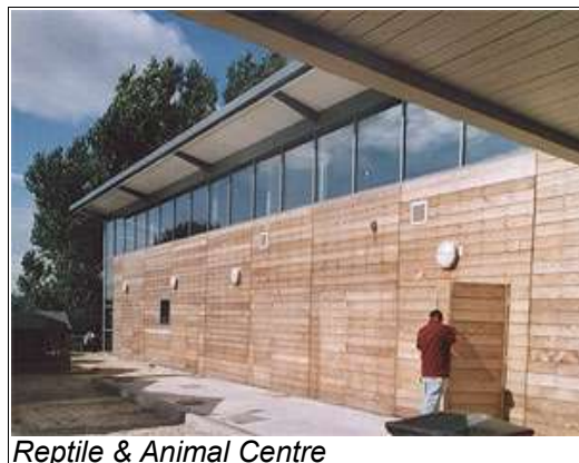
Reptile & Animal Centre

The centre is a new building by architects Walton Horsfall and Associates, built on a rather difficult steeply sloping site. Interestingly it has its own wind generating tower to charge the batteries for the reptile house. We have not yet had the chance to have a full visit here but what has been seen was enough for us to put this building forward for a Civic Trust Award, together with an interesting modern house in Birkby by the architects Acumen.