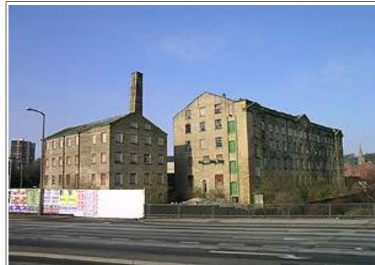
Folly Hall Mill

The Railway Warehouse has a history of promises left unfulfilled and we may be entertaining another false hope. Meanwhile it is heartening to see the continuing progress of conversions at the Commercial Mills site in Firth Street, a success story that shows what is possible once work gets underway.