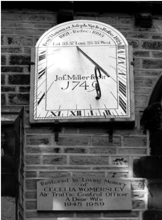
St Mark's, Longwood