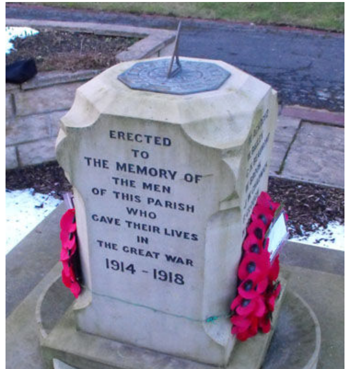
St Philip parish war memorial

moved to the present position in a memorial garden in the churchyard in 2002.