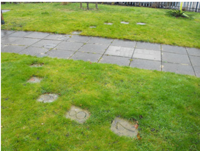
Prospect Street Garden sundial