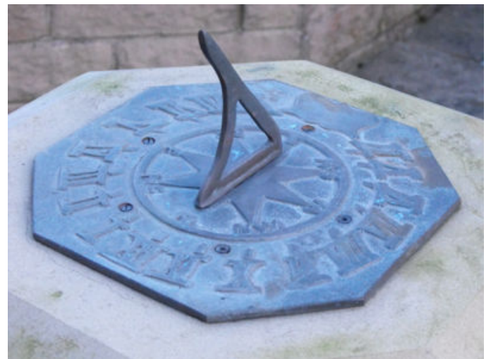
North orientated gnomon at Birchencliffe

The St Philip memorial is one of 51 UK war memorials recorded as having a sundial.